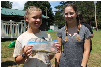
Finding a deer bone in the woods