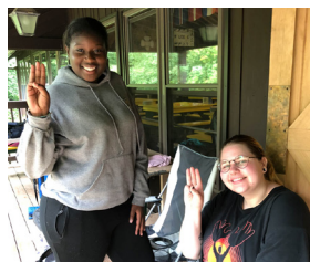
Feeling the Girl Scout vibes