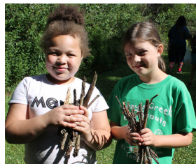
Collecting wood for a cookout