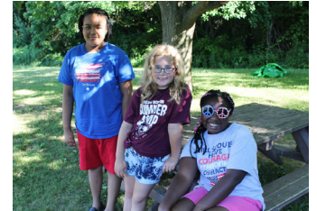
Celebrating Independence Day