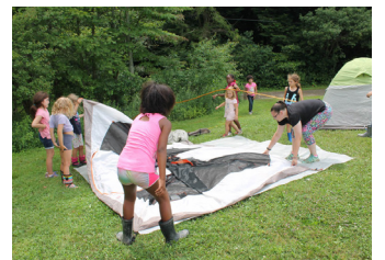
Pitching tents for a night out