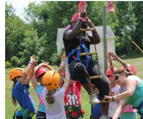
Getting on the ropes course