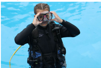
Scuba in the pool