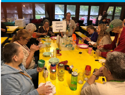
The annual Great Escape Weekend is a chance for adult volunteers to learn new skills and make new friends at Camp Seven Hills.