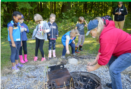
Daisies and Brownies went to Camp Windy Meadows for Trailblazer I to learn outdoor basics like hiking and backpacking, Leave No Trace, map use, fire building, and outdoor snacking.