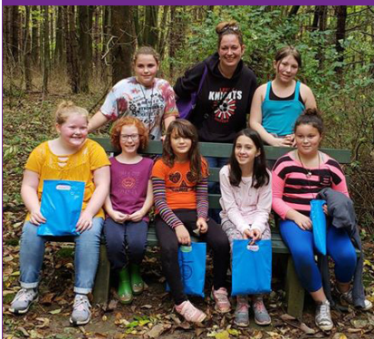
Troop 42162 from LeRoy went to Genesee County Park to work on earning their Geocaching Badge!