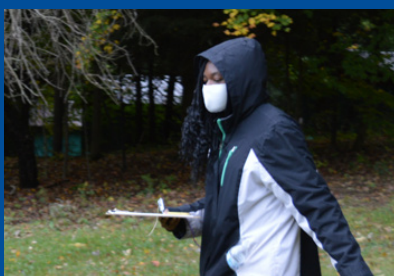
Volunteers served as judges virtually and in-person