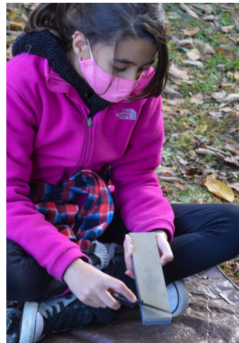
Jackknife made another appearance this year with girls showing off their knife skills safely.

The knots and lashing event gives girls the opportunity to show the real-life applications that the different knots are useful for.