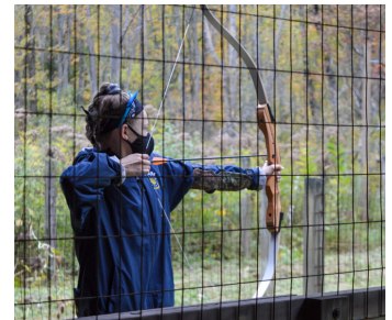
A girl goes for a bullseye at archery.