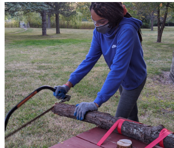
Leading up to the event, girls practiced with their troops.