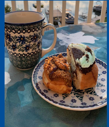
Lots of people got a taste of both flavors, often with coffee.