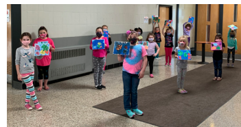
Troop 31262 painted rocks and canvas for their Painting badge.