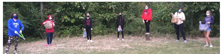
Troop 70214 has started their Silver Award by cleaning up the Starpoint Nature Trail (Lockport).