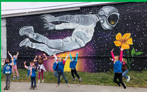
Troop 30072 visited the Hertel Walls in Buffalo