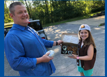
One girl dropped off donuts to her dad during his workday.