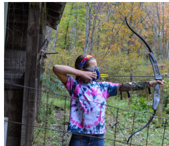
Orienteering is still a staple event.