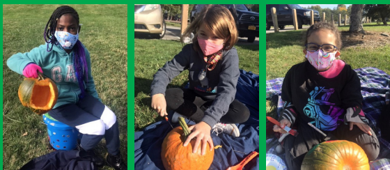
Troop 64200 earned their Outdoor Art Badge