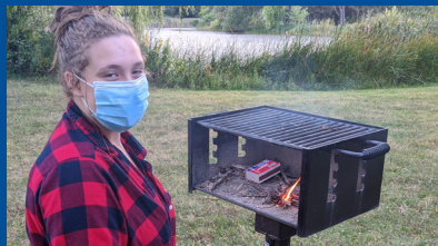
A girl from Troop 70283 practicing firebuilding before Skills and Chills