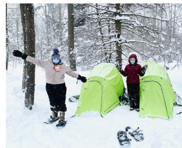
Girl Scouts participated in the Intermediate Winter Camping program at Camp Seven Hills Lakeside and camped overnight in the snow in a tent!