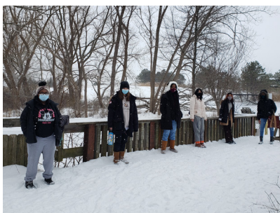
Olmsted Girl Scout Troop 30134 visited Tiffy Nature Preserve. They enjoyed a winter hike accompanied by deer, chickadees, nuthatches, and cardinals.

Check out gswny.org for details and modified business hours.