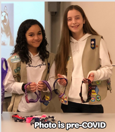
Photo is pre-COVID