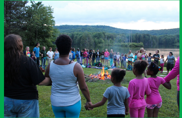
2017 Closing Campfire at Camp Timbercrest